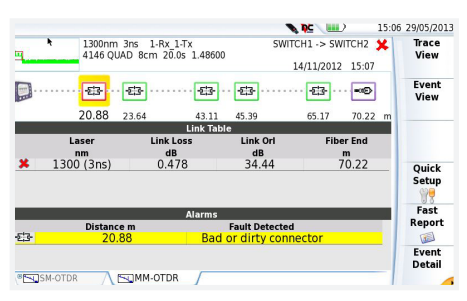
OTDR Trace View

VIAVI T-BERD/MTS handheld modular platforms are ideal field testers that let users inspect fiber connectors as well as test and certify any fiber connector and fiber link according to international standards. They can instantly generate comprehensive pass/fail summary reports on site with the onboard Fast Report function.