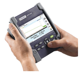
One-slot handheld modular platform for single-mode/multimode fiber testing