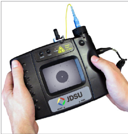
HD2-P4-V Display with Integrated Patch Cord Microscope (PCM) and Visual Fault Locator (VFL)