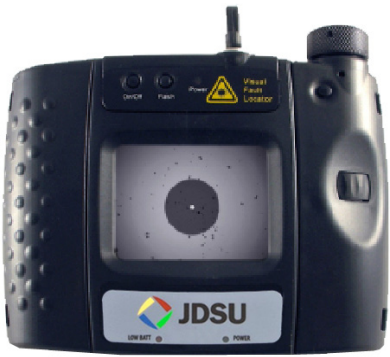
HD2-P4-V Handheld Display with 3.5-in LCD