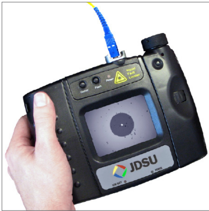
HD2-P4-V Display with Integrated PCM and VFL