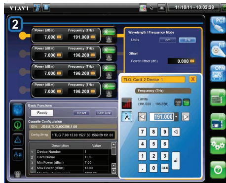
Example of an mTLG screen

The MTLG-C1 is a member of MAP-200 LightDirect basic fiber optic test tool family. LightDirect modules can be deployed in all available MAP chassis systems including the MAP-220C two-slot benchtop chassis. The MAP-220C is ideal for bench use or small test automation projects, and it features a local touch screen as well as Ethernet or GPIB automation. The second slot is ideal for an optical power meter or variable optical attenuators. The MAP-230B (three-slot) or MAP-280 (eight-slot) is ideal for large deployments and is the most compact optical test solution on the market.