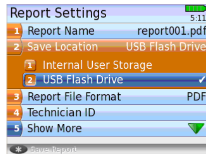
Generate test reports in PDF file format on the Internal User Storage or USB Flash Drive. Access files on the Internal User Storage from an FTP client on a remote PC.