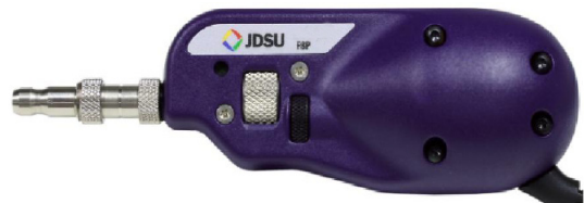
FBP Probe Microscope

The FBP video probe microscope, in single or dual-magnification (200/400X), is the essential inspection tool for use with JDSU test platforms. The key components of the probe include an integrated light source, a 1/3-inch complimentary metal oxide semiconductor (CMOS) video camera, a focusing mechanism, and an optional image capture button. It is powered through the universal serial bus (USB) port and utilizes a blue coaxial light emitting diode (LED) light source with an advanced camera system to produce a high resolution fiber end face image. It fits and operates comfortably and easily in-hand, letting users inspect hard-to-reach connectors that are installed on the backside of patch panels or inside optical devices. The focus control is conveniently located on the probe to easily adjust the focus of the fiber image, while the optional dual-magnification control lets users quickly change between high- and low-magnification views.