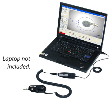
Laptop not included.

The USB analog-to-digital converter is available in either a 4-pin or 6-pin configuration. The FBPP-USB3 connects to a standard 4-pin FBP probe, while the FBPP-USB1 model connects to a 6-pin FBP probe equipped with an integrated QuickCapture™ button used to instantly capture fiber end face images.