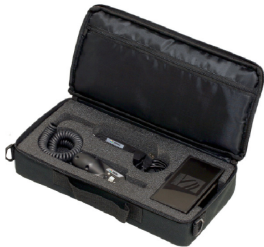
FBP-MTS-001 T-BERD/MTS Fiber Inspection Upgrade Kit