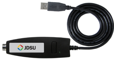
USB 1.1 Analog-to-Digital Converter