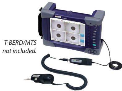
T-BERD/MTS not included.

The FBP probe microscope connects to the JDSU optical test platforms or to a PC/laptop via a USB digital converter. Simply connect the FBP probe to the module and plug the USB connection in an open USB port. The USB module, like the probe, offers an optional QuickCapture™ button to instantly capture the fiber end face image on the display. For use with a PC/laptop, a fiber analysis program (FiberChek) is included on a CD and requires software/hardware installation. No additional software is needed to interface with these JDSU test platforms: T-BERD, MTS, or TestPad.