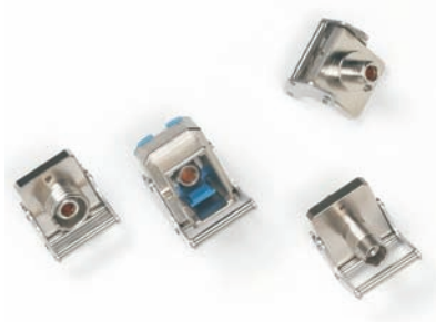
Optical adapters (BN 2150) for laser source output