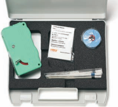
OCK-10 Optical Connector Cleaning Kit (accessory)