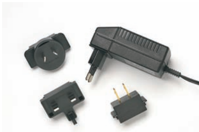
Worldwide compatible AC adapter/charger (SNT-121A)