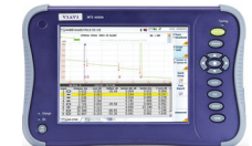
T-BERD/MTS-6000v2 Full-band OSA