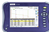
T-BERD/MTS-6000Av2 Metro Ethernet, backhaul (dual 10 GE), CPRI/OBSAI