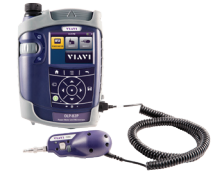
Inspect, clean, test, and certify Pro tools cell tower kit