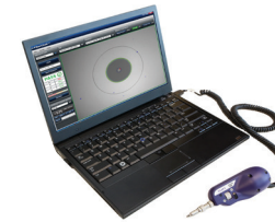
Inspect, pass/fail, and FiberChekPRO™ Base station kit