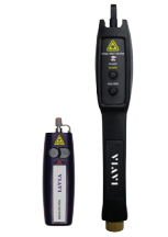
VFL Continuity and trace Economy and basic