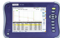
T-BERD/MTS-6000v2 Backhaul OTDR EVO, FiberComplete EVO (auto-bidirectional LTS+ORL+OTDR), and CWDM OTDR