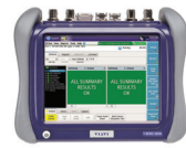
T-BERD/MTS-5800v2 Metro Ethernet, cell backhaul (to 10 GE), and CPRI/OBSAI