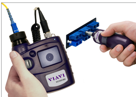
FBE Probe with HD3-P Display

Wide selection of inspection tips and adapters for mainstream connectors and applications