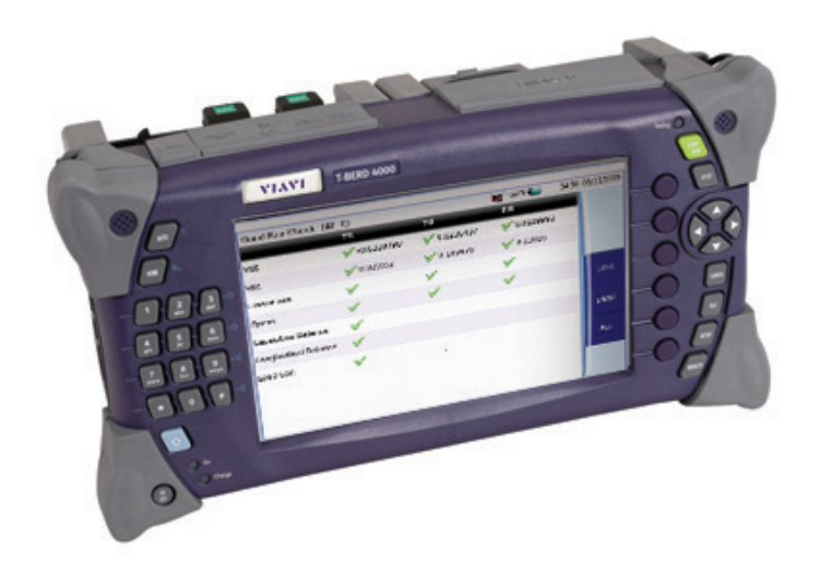
The T-BERD/MTS-4000 large, color GUI makes reading even the most complex copper test results easy.