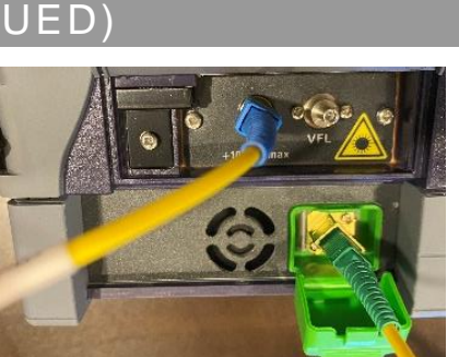
Figure 7: Self Reference Connection