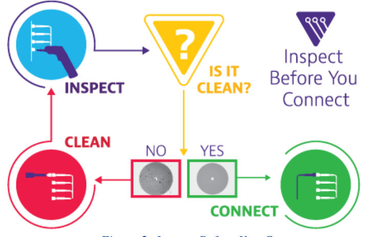
Figure 2: Inspect Before You Connect

https://www.viavisolutions.com/en-us/products/otdr-fiber-characterization