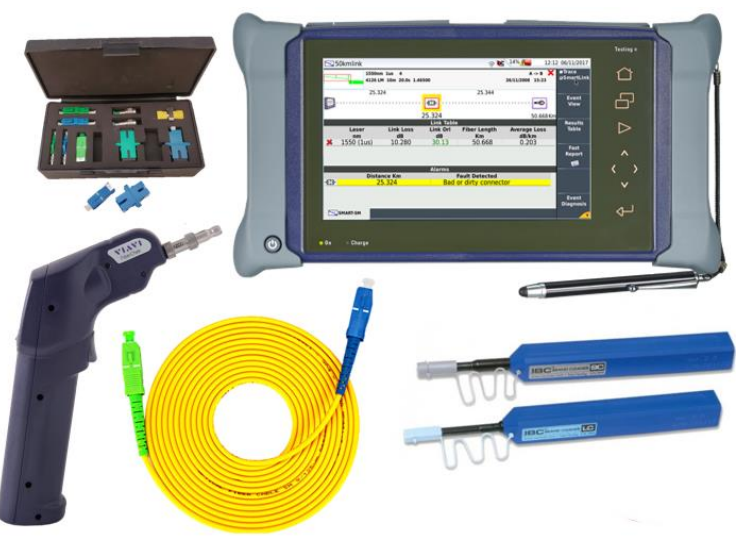
Figure 1: Equipment Requirements