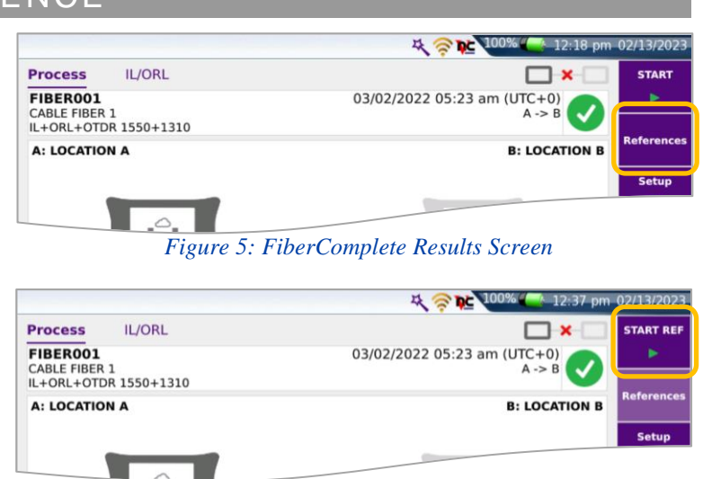
Figure 6: START REF