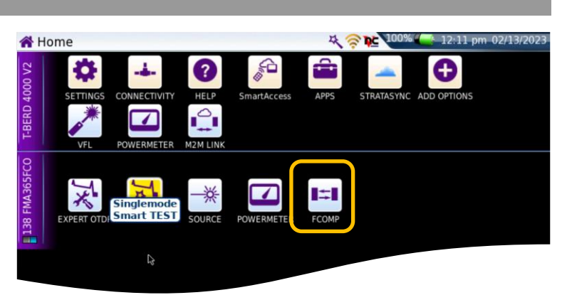
Figure 4: Launch FiberComplete