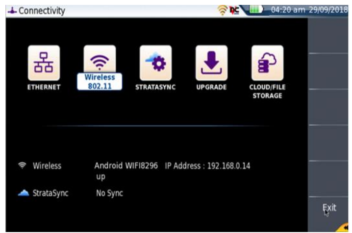
Figure 6: Connectivity screen