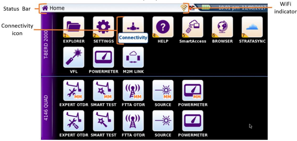
Figure 4: Home Screen

Press the HOME button to display the Home Screen