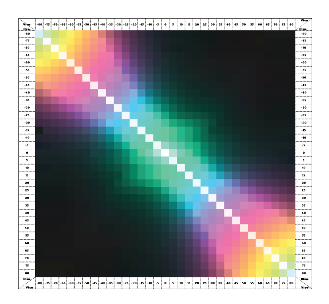
Figure 2. Color gamut of ChromaFlair Green/Purple 190, demonstrating the high degree of gonio-apparency