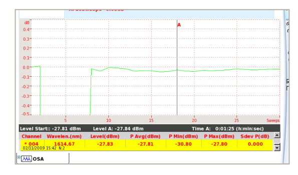
Drift power measurement

For optical performance monitoring it is essential to measure the key parameters over time. The built-in drift test application provides the result of power and wavelength over a customer definable time in a graphical and numerical format. Drift measurements are important in CWDM networks with uncooled laser, which have a typical wavelength drift of 0.1 nm/°C.