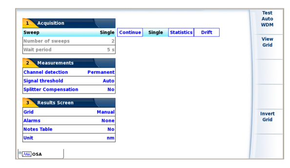
COSA set-up menu

One-button auto-testing guarantees that technician needs no special training to carry out a CWDM test, making the VIAVI instrument suitable for both novice and expert technicians. An Auto-Test mode automatically identifies WDM channels, selects the appropriate wavelength range, and provides auto scaling and system qualification according to pre-defined parameters.