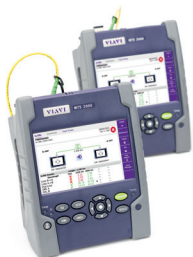
One-slot handheld modular test platform for fiber applications