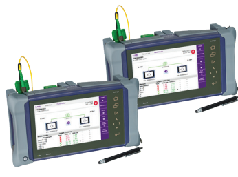
Two-slot handheld modular test platform for fiber applications