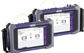
Three-slot handheld modular test platform for fiber, wireless and transports applications