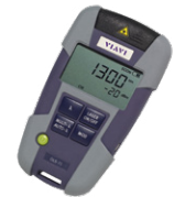
Optical Light Source