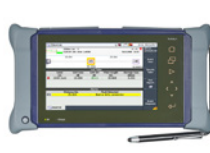
T-BERD/MTS-4000 V2 two-slot handheld modular platform for testing fiber optic networks