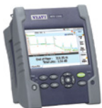
T-BERD/MTS-2000 one-slot handheld modular platform for testing fiber networks