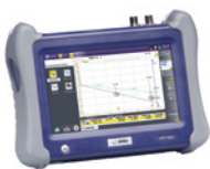
T-BERD/MTS-5800 handheld test instrument for testing 10G/100G Ethernet and fiber networks