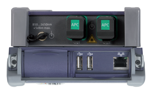
T-BFRD/MTS-2000 with PON Power Meter Module