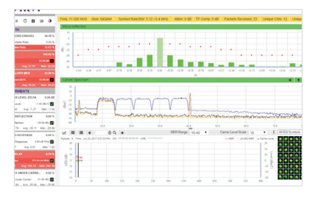
Live MACTrak display showing micro-reflections

MACTrak Performance History shows the node's history and individual upstream carriers to find the cause for a poor node ranking. Metrics such as carrier level, equalized and un-equalized MER, impulse noise and codeword errors, as well as MAC address help MACTrak node ranking assess both RF and data health.