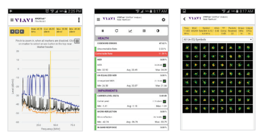
All displays mobile-friendly in XPERTrak