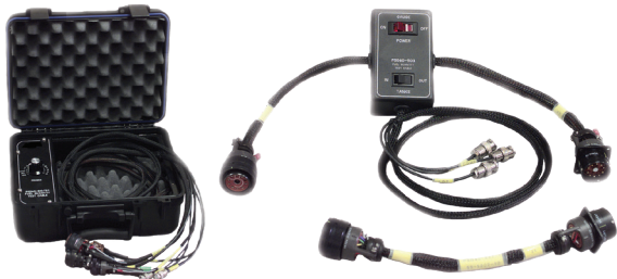
Large selection of aircraft specific interface cables available

Each aircraft platform requires a unique interface to access the FQIS. The complexity of the fuel system determines the capability of the interface to allow for complete testing of the fuel quantity system. Contact VIAVI for the proper interface for your aircraft.