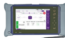
T-BERD/MTS-4000 V2 Two-slot handheld modular platform for testing fiber networks