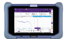
OneAdvisor 800 All-in-One Cell-site Installation and Maintenance Test Solution