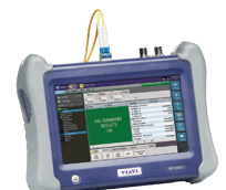
T-BERD/MTS-5800 Handheld test instrument for testing 10G Ethernet and fiber networks