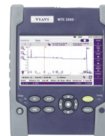
T-BERD/MTS-2000 V2 one-slot handheld modular platform for testing fiber networks