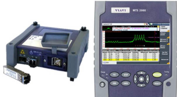
Figure 1: Equipment Requirements