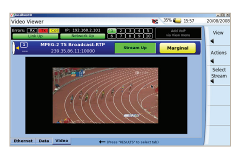
Example of IPTV video stream test