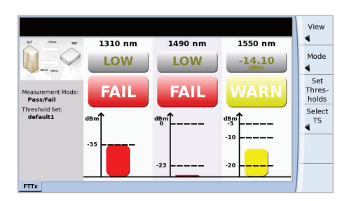
PON meter user interface