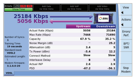
VDSL test interface