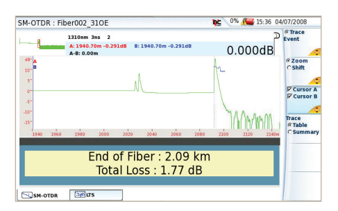
Example of an OTDR trace