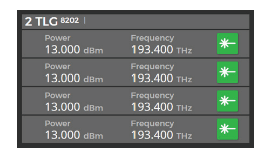
Figure 1 - mTLG MAP-300 summary view

An intuitive graphic user interface (GUI) is optimized for use in either a laboratory or a manufacturing environment. Efficient transition between summary and detailed views (Figure 1 and Figure 2) allow users to operate at a system level or access the full power of a module.