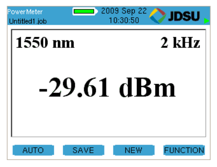
Shows optical power levels in dB or dBm

The ValidatorPRO-NT version includes a comprehensive set of features for testing a network's active network capabilities: measure Power over Ethernet (PoE) to ensure the correct power is available on the correct pins, use port discovery to ensure the correct speed and duplex capability are available; connect at gigabit Ethernet and run ping tests to verify connectivity to IP hosts; discover network devices using Cisco Discovery Protocol (CDP) or Link Layer Discovery Protocol (LLDP), discovery and display essential information regarding functionality and configuration of 802.11 b/g/n networks.