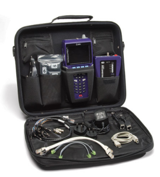
ValidatorPRO NT1150 ValidatorPRO-NT NT1155