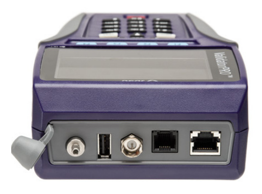
Test fiber and copper (telco, network, and coax) cables

The ValidatorPRO includes an integrated optical power meter that measures optical power at 850/1300/1310/1490/1550 nm on multimode or single-mode fiber to address an increasing number of Ethernet networks that now include optical links.