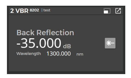
Figure 2 - mVBR MAP-300 summary view GUI

An intuitive graphic user interface (GUI) is optimized for use in either a laboratory or a manufacturing environment.