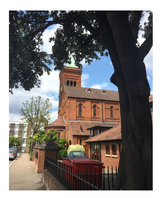
Figure 2. Church building housing the base station

After discussing with the operator the area where the interference issue was present, the team set out for a drive with InterferenceAdvisor. The cellular base station covering the area of interference was housed within the church grounds shown in figure 2.