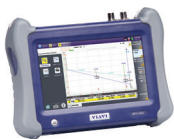
T-BERD/MTS-5800 Handheld test instrument for testing 10 G Ethernet and fiber networks