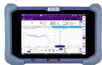
OneAdvisor 800 All-in-One wireline and wireless network installation and maintenance test solution