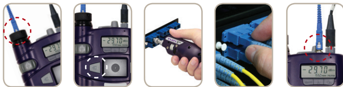
1 INSPECT PATCH CORD 2 ACTIVATE PROBE 3 INSPECT BULKHEAD 4 CONNECT 5 TEST

To promote systematically adopting proactive inspection, Viavi developed the proactive inspection model "Inspect Before You Connect," which promotes the visual inspection procedures and pass/fail criteria set forth in the IEC-61300-3-35 visual inspection standard. By guiding technicians with varying levels of expertise in the proper implementation of proactive inspection, the addition of this model to fiber handling essentials ensures that proactive inspection is performed correctly every time.