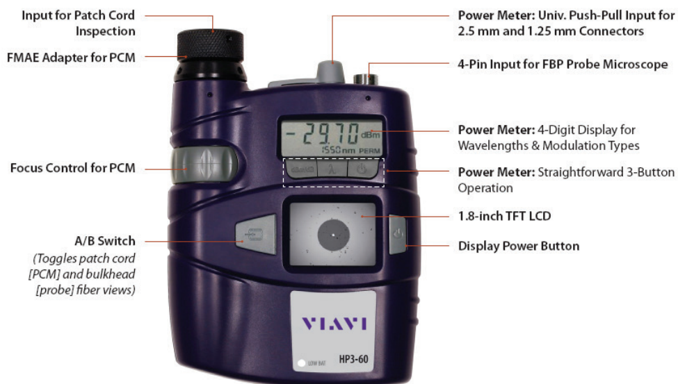
Viavi HP3-60 System with Integrated Power Meter and Patch Cord Microscope (FIT-HP3-60-P4)

To address the barrier of time costs, the design of the HP3-60 enables a seamless workflow for inspection, cleaning, and testing of both male patch cord and female bulkhead connectors.