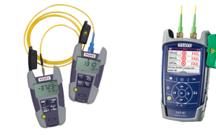
SmartPocket RFOG high power level power meters and light sources