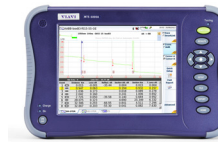
T-BERD/MTS-6000A with OSA110M or 110R