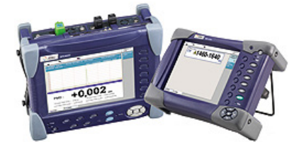
T-BERD/MTS-8000E or T-BERD/MTS-6000 Advanced Fiber Characterization Kit OTDR, PMD, CD, AP (Modules fit both T-BERD/MTS-8000 and T-BERD/MTS-6000)