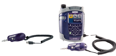
P5000i Integrated Inspection and Test