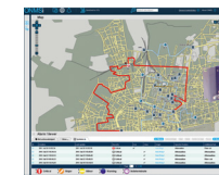
Optical Network Management System (ONMSi) 24/7 Remote Fiber Network Monitoring