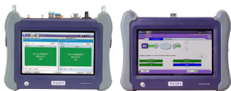
T-BERD/MTS-5800 100G and SmartClass 4800