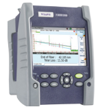
T-BERD/MTS-2000 Handheld Modular Test Set