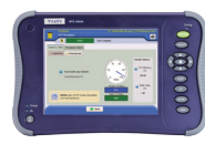
T-BERD/MTS-6000A and T-BERD/MTS-8000E Modular Test Platforms (Transport to 100 G), Ethernet 10 Mbps to 100 G, DS1 to OC-192, CPRI, Fibre Channel, TrueSpeed, One-Way Latency, Fiber testing