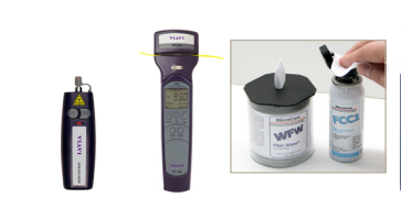
Visual Fault Locator (VFL) Live Fiber ID Fiber Cleaning