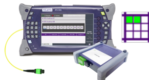
T-BERD/MTS 4000 with MPO Switch and Cable-SLM