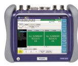
T-BERD/MTS-5800 Handheld to 100G, MetroE, Cell Backhaul, 10 GE, TrueSpeed, PRI-ISDN, VoIP (SIP), Fiber testing