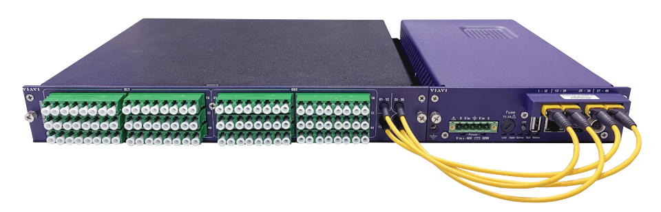
OTU-5000 with a 48 port (Test Access Point) TAP and 48 port MPO switch