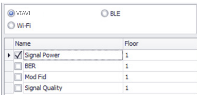
Signal selection menu from the NEON Command Software