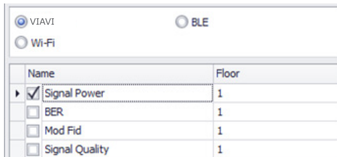
Signal selection menu from the NEON Command Software