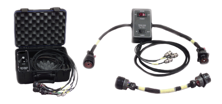
Large selection of aircraft specific interface cables available