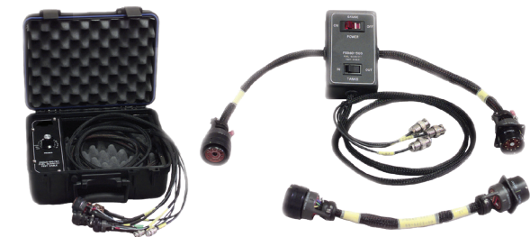
Large selection of aircraft specific interface cables available

Each aircraft platform requires a unique interface to access the FQIS. The complexity of the fuel system determines the capability of the interface to allow for complete testing of the fuel quantity system. Contact VIAVI for the proper interface for your aircraft.