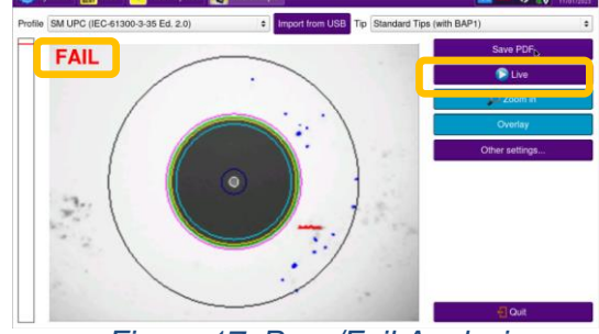
Figure 17: Pass/Fail Analysis