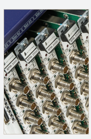
Close-up view of the rear of a HCU1500 showing RPM2000 modules