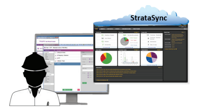
Operators and/or supervisors create MOPs on a PC and distribute via StrataSync

The TestWizard solution lets mobile operators create standardized test procedures for MOPs on a PC. They can then easily distribute them, via cloud-based StrataSync, to all their contractors' and cell technicians' CellAdvisor analyzers. As a result, technicians test in conformance with the operator's exact criteria just by following TestWizard prompts on the analyzer—minimizing training and certification requirements. Test results can then automatically upload to StrataSync, expediting installation and ensuring best maintenance practices.