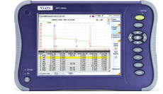
T-BERD/MTS-6000v2 Full-band OSA