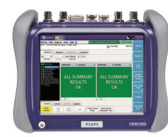
T-BERD/MTS-5800v2 Metro Ethernet, cell backhaul (to 10 GE), and CPRI/OBSAI