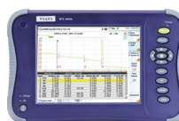
T-BERD/MTS-6000Av2 Metro Ethernet, backhaul (dual 10 GE), CPRI/OBSAI