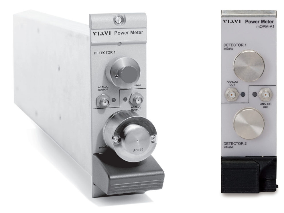
Figure 1 Installing the Integrating Sphere

The AC330 accessory can be directly screwed onto the front panel of the MAP-200 Optical Power Meter Module, as shown in Figure 1.