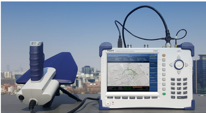
AntennaAdvisor Connected to CellAdvisor

CellAdvisor, CellAdvisor 5G, and OneAdvisor-800 also perform a radial signal strength test, interpolating consecutive measurements and indicating the direction from which the strongest interferer signal is received. This provides a complete profile of the signal's transmission, making signal-level comparisons automatically to dramatically speed the interference finding process.