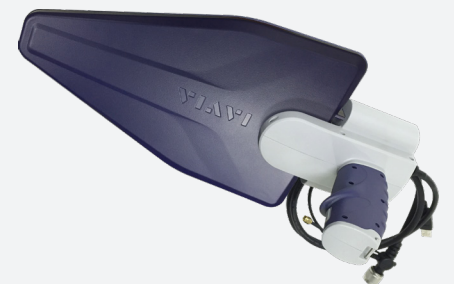
AntennaAdvisor with broadband log periodic antenna