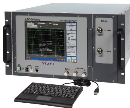
Standard accessories include keyboard with touchpad.