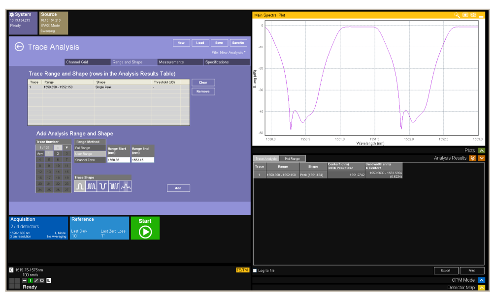
Figure 3. Improved software with easy-to-use analysis tools

The set of mSWS-A2 data link layers (DLLs) can be used to develop software for custom testing requirements. The DLLs function through the mSWS receiver hardware, allowing access to all SWS functionality. Using the supplied DLLs, users can develop applications in Visual Basic ^{\mathsf{TM}} , C, C++, or LabView environments.