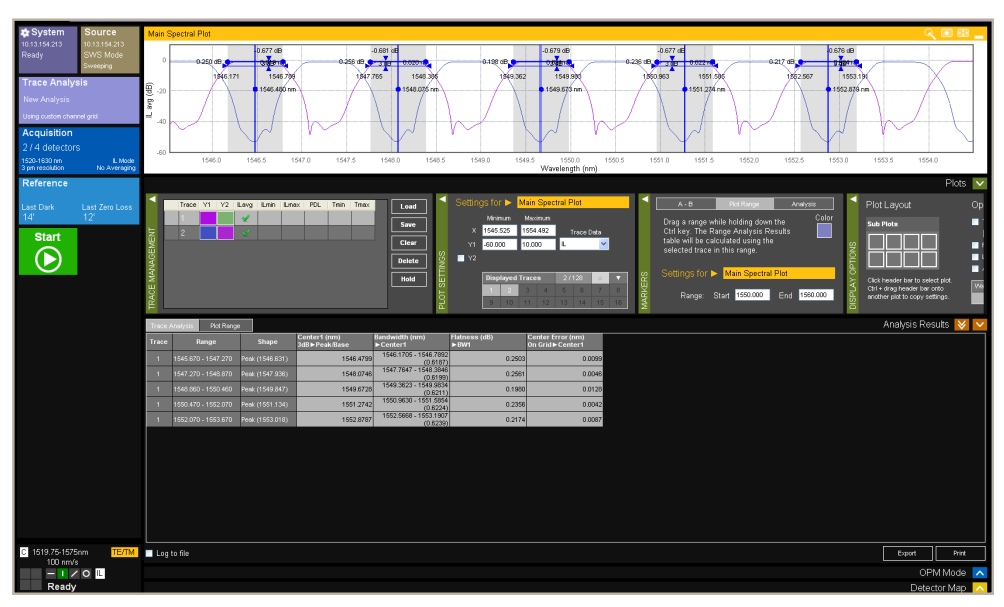
Figure 2. Example of mSWS interleaver scan

The SWS directly measures IL, PDL, and insertion loss as a function of wavelength and measures RL with the optional RL modules.