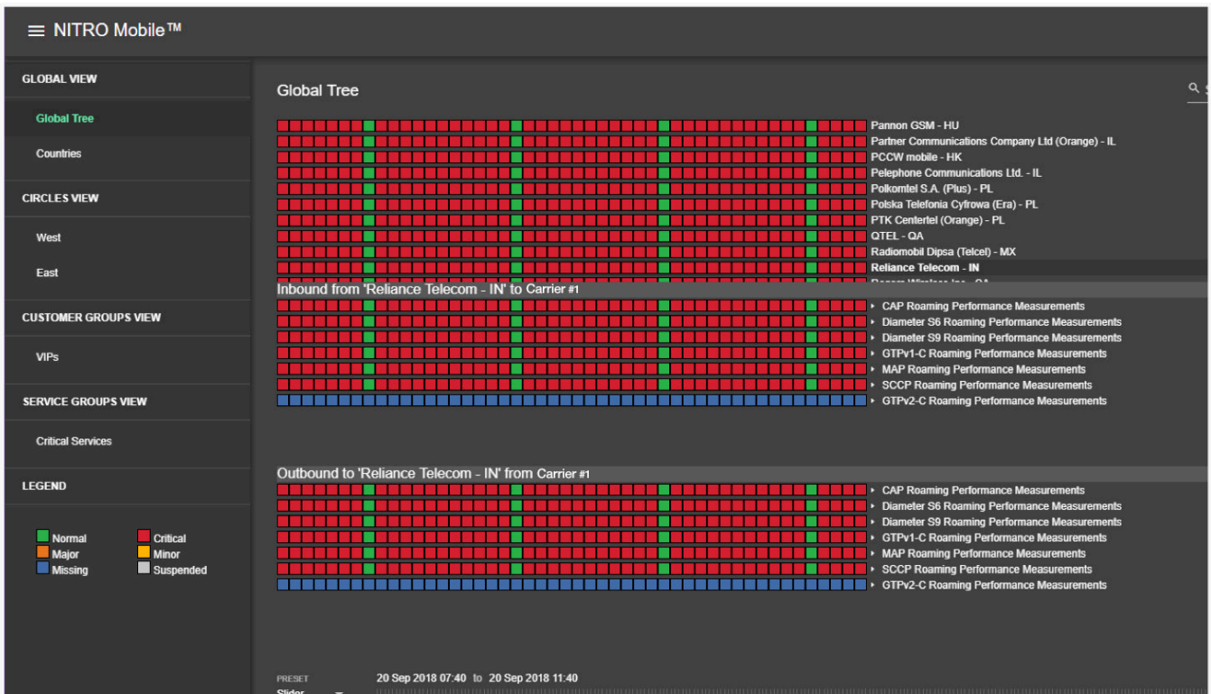
Global roaming dashboard

Major UK operator had their Network Node Global Title deleted from a major International carrier's gateway to Germany. Problem occurred late Friday evening and failure to resolve incurred revenue loss of $1.5 million per day.