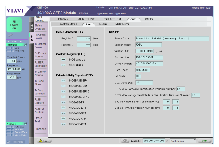
Figure 1. The ONT CFP2 overview screen displays key information provided by the module's MDIO.

Other MDIO registers may let you control and monitor important module elements as shown in Figure 2, such as lasers, CDRs, and receivers. It is possible to use a CFP/ CFP2 without the MDIO (and instead using the control pins); however, it limits both the functionality and capabilities.