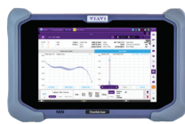
OneAdvisor 800 All-in-One wireline and wireless network Installation and Maintenance Test Solution