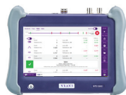
T-BERD/MTS-5800 Handheld test instrument for testing 10 G Ethernet and fiber networks