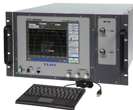
Standard accessories include keyboard with touchpad.