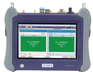
Figure 4. T-BERD/MTS 5800-100G

To test AOC and DAC cables, Viavi has introduced an integrated script to automate cable assembly testing. Viavi's T-BERD/MTS 5800-100G, shown in Figure 4, provides all-in-one testing at line rates up to 112Gbps. The 5800-100G supports all Ethernet rates with dual-port capabilities including 10/100/1000BASE-T, optical GE, 10GE, 25GE, 40GE, and 100GE. Technicians can test numerous applications including AOC/DAC cables in addition to metro, backbone, and data center interconnectivity. Although a small size, the 5800-100G can test from DS1/E1 to OTU4 including CPRI, Fiber Channel, PDH, SONET/SDH, OTN, and Ethernet. In addition, the 5800 platform expands to support OTDR modules, fiber inspection with auto-focus, and advanced timing and synchronization capabilities. These tools are all supported by StrataSync which provides cloud-based asset management, configuration, and reporting for easy management and sharing. The 5800-100G is a complete test and measurement solution to support the needs of the data center user in the data center, including AOC and DAC cable testing.