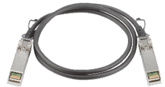
Figure 3. DAC Cable

Direct Attach Copper (DAC) cables as shown in Figure 3 are an alternative when the cable itself is made of copper instead of an optical fiber. A DAC may be passive to provide a direct electrical connection or active when signal processing circuitry is integrated in the DAC built-in connectors. Just as with an AOC, a DAC will be terminated by SFP or QSFP depending on the line rate. As a comparison, AOC cables support longer transmission distances, use less power, and are more lightweight than DAC cables. However, they cost more and optical fibers can be more easily damaged than copper cables. When comparing AOC cables to traditional fiber optic cables connected to pluggable optics, AOCs provide a simplicity of installation without the need to consider interconnection loss, and eliminating of the need to clean and inspect fiber end-faces before making a connection. However, AOC cables cannot be used in EOR/MOR configurations that use patch panels as described earlier.