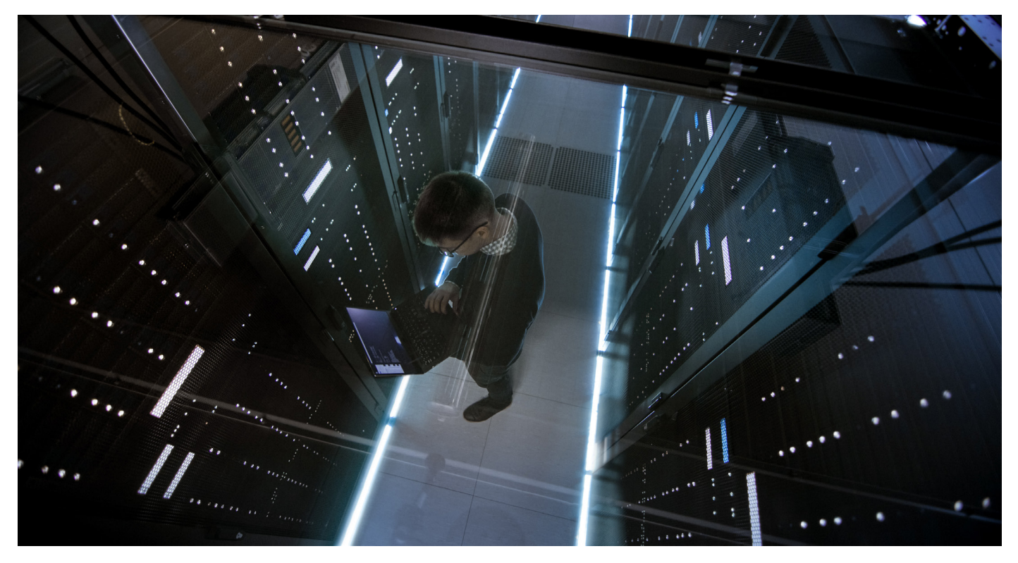
4 Faster Deployment and Monetization of Hyperscale and Edge Data Centers

Because the FiberComplete PRO test process is fully automated, the data/reports can be collected in the VIAVI cloud data management system. For example, when physical installation has occurred and there is a desire to pretest connectivity to confirm its ability to carry desired bandwidth with necessary performance metrics, e.g., 10-100G or 100G-400G, with characterization and BER testing. Visibility into these Key Performance Indicators (KPIs) and graphics provide prompt identification of issues or low-quality deployment, providing an instant health check of the fiber infrastructure and the ability to quickly adapt or change process.