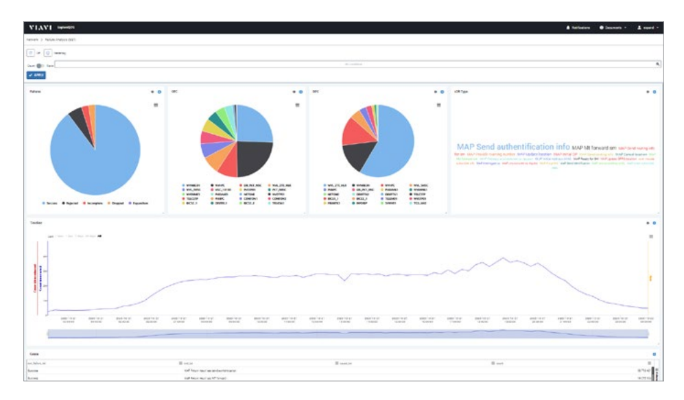
SS7 Failure Analysis dashboard in ExploreQOS

ExploreQOS aggregates and correlates millions of subscriber-centric data events 24/7 across the entire network. It can quickly assess which of the network elements and/or services are being impacted. From a high-level view of the network performance to detailed KPI trends, users obtain immediate insights into the performance quality of their network and can have a clear picture of the subscribers' experience across multiple vendor and access technology areas.