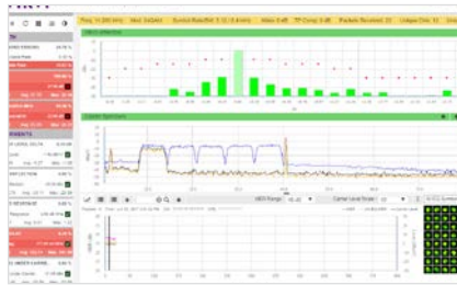
Live MACTrak display showing micro-reflections

MACTrak Performance History shows the node’s history and individual upstream carriers to find the cause for a poor node ranking. Metrics such as carrier level, equalized and un-equalized MER, impulse noise and codeword errors, as well as MAC address help MACTrak node ranking assess both RF and data health.